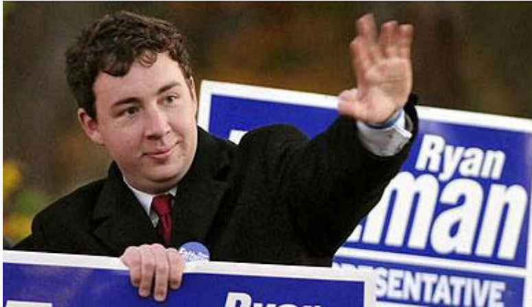
On the campaign trail.